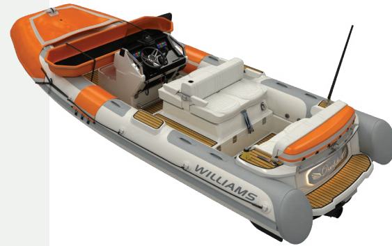
DieselJet Solas 565 in rescue mode

While all our tenders are CE-certified, and more than meet industry safety standards, many tender owners don't need the additional functionality of a SOLAS rescue tender. But for those who do – especially those with yachts that weigh more than 500GT – we want to ensure they don't have to choose between SOLAS certification and the very best tenders on the market.