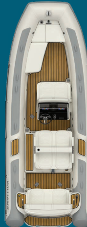
625 11 PERSONS SOLAS