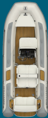
505 8 PERSONS SOLAS