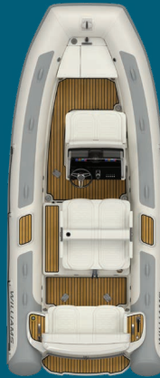
565 9 PERSONS SOLAS